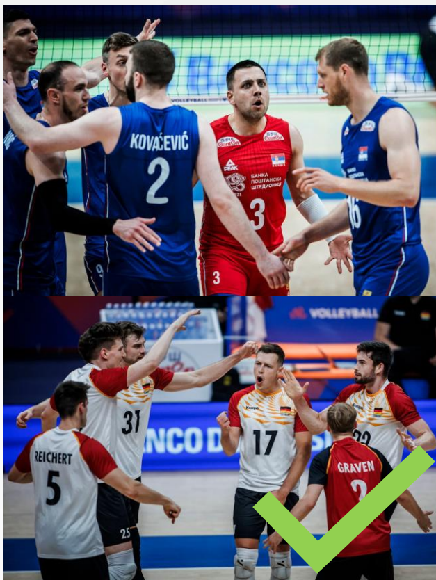
3 colors, correctly used

Use 4 different colors. If not possible – it is acceptable to have both team liberos' colors match.