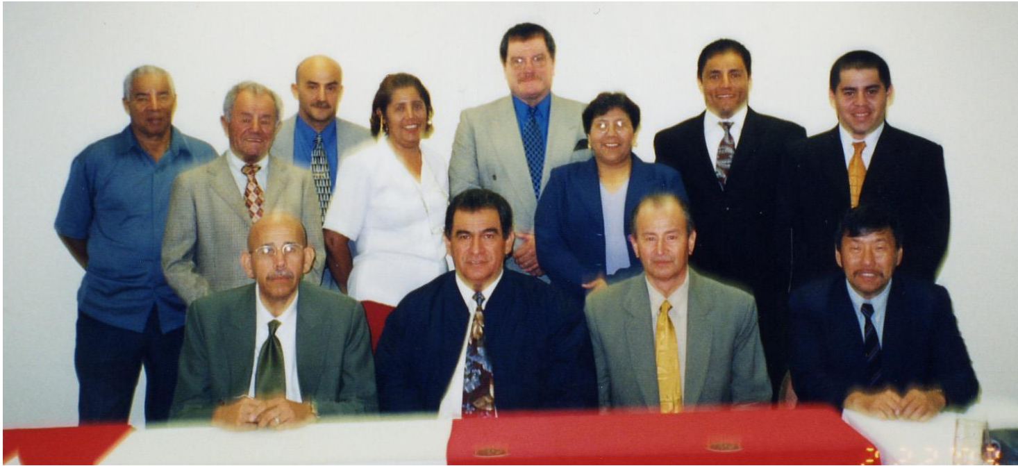
ASAMBLEA GENERAL 2002 Hotel La Condesa