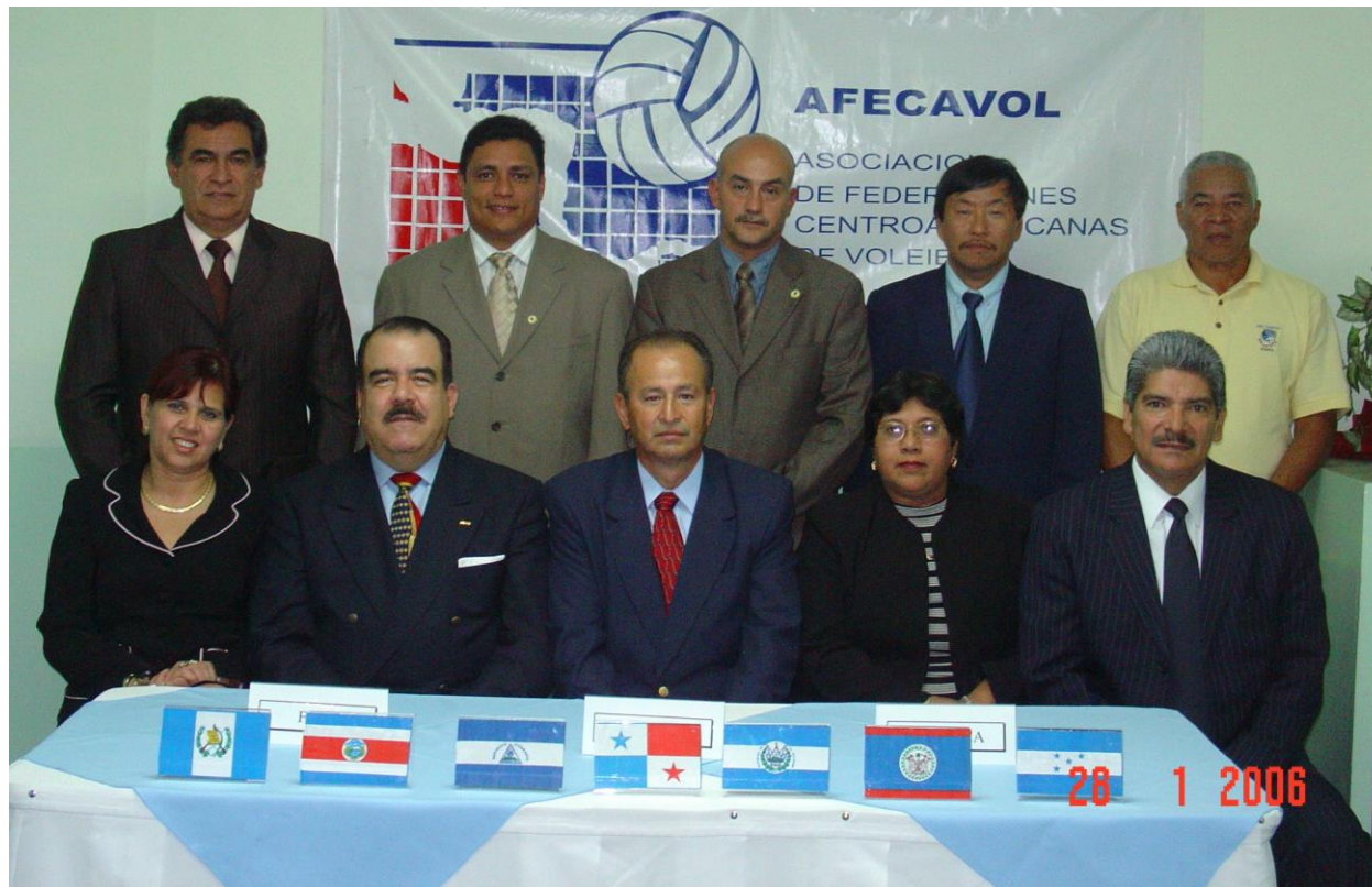
ASAMBLEA GENERAL 2005 Hotel Centro Colón