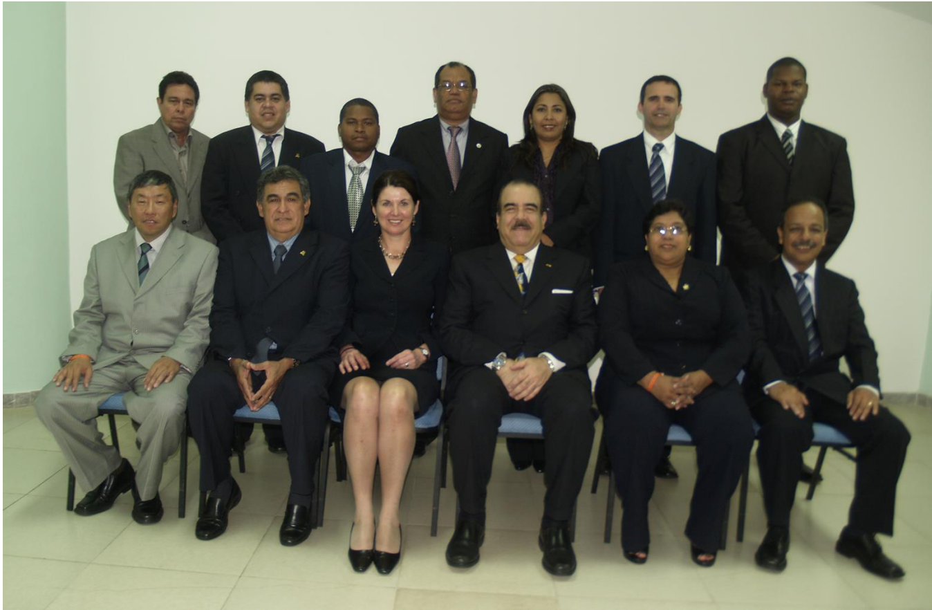
ASAMBLEA GENERAL 2010 GUATEMALA