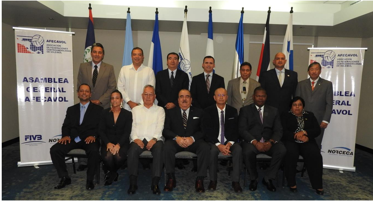
ASAMBLEA GENERAL 2019 COSTA RICA