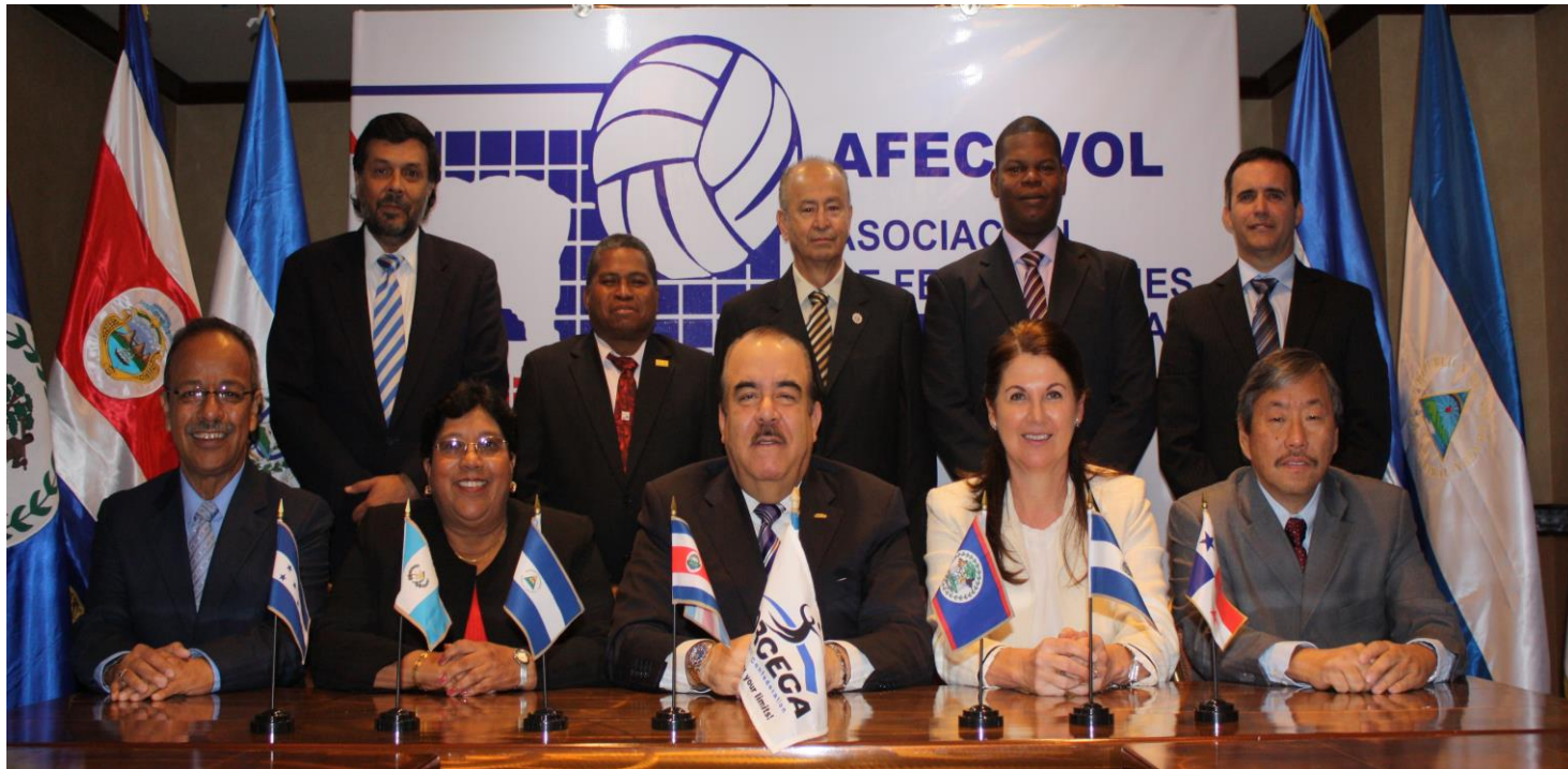
ASAMBLEA GENERAL 2014 GUATEMALA