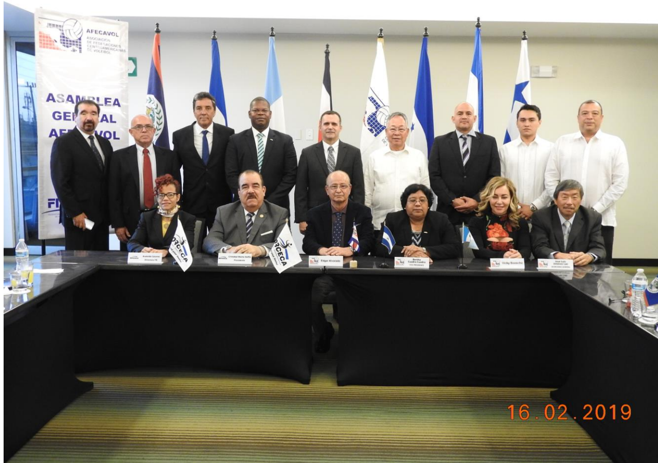
ASAMBLEA GENERAL 2018 COSTA RICA