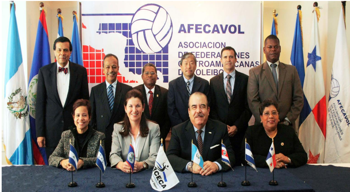
ASAMBLEA GENERAL 2013 GUATEMALA