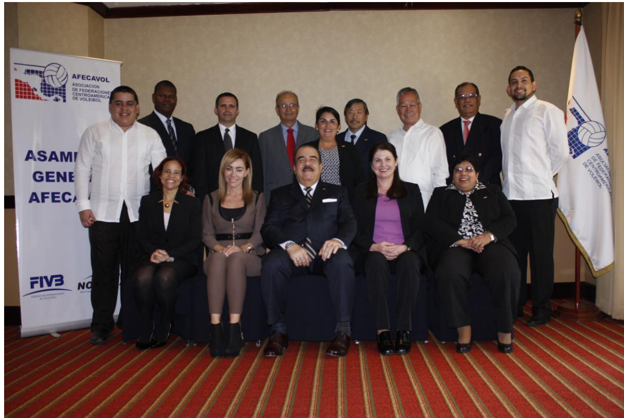
ASAMBLEA GENERAL 2016 GUATEMALA