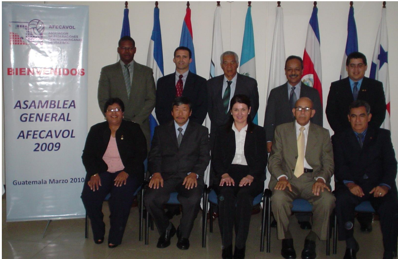
ASAMBLEA GENERAL 2009 GUATEMALA