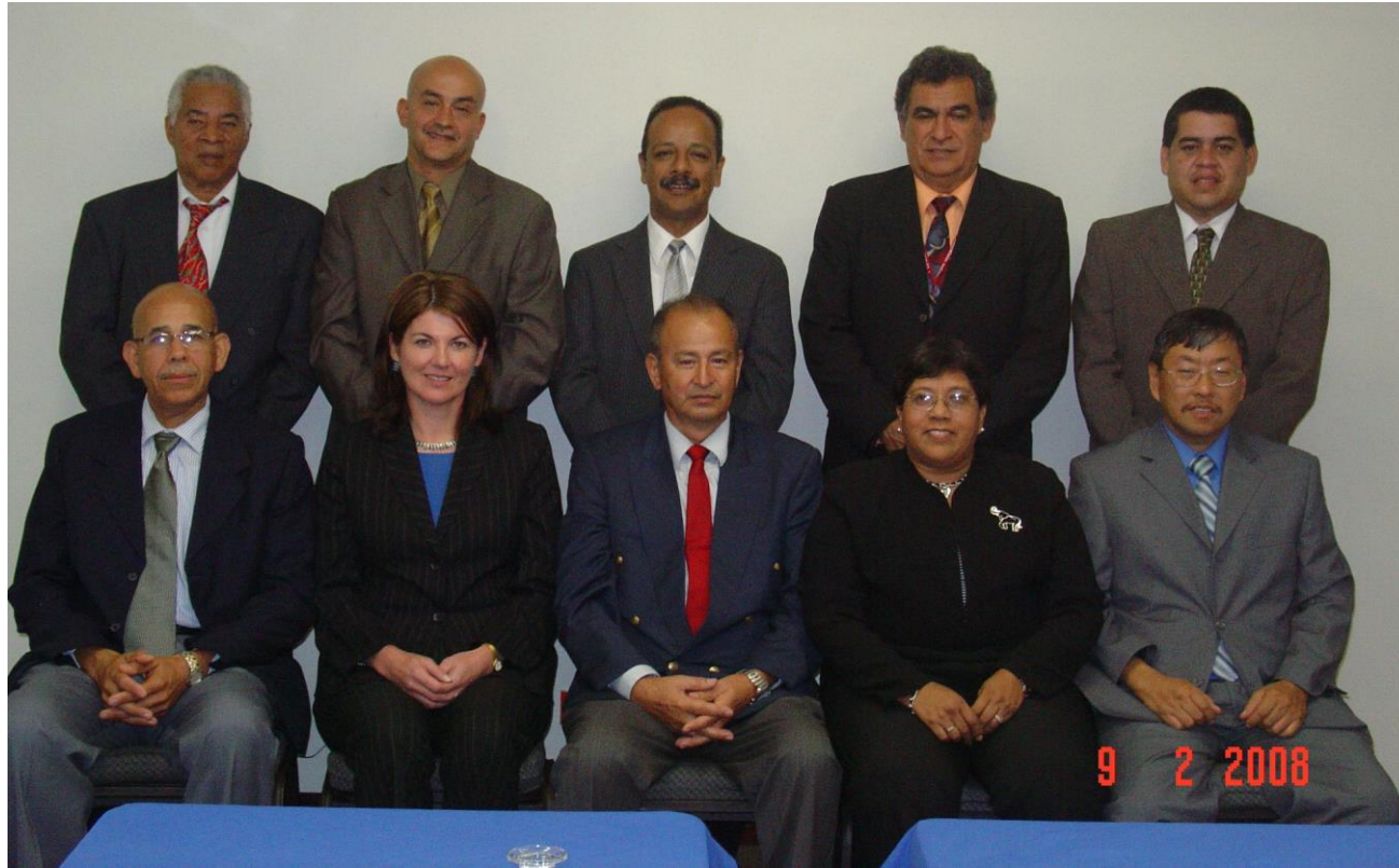
ASAMBLEA GENERAL 2007 Hotel Casa Conde