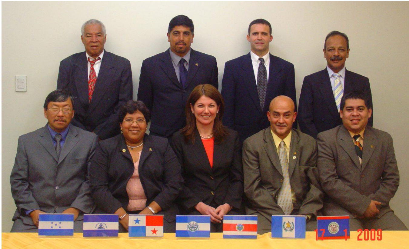
ASAMBLEA GENERAL 2008 COSTA RICA