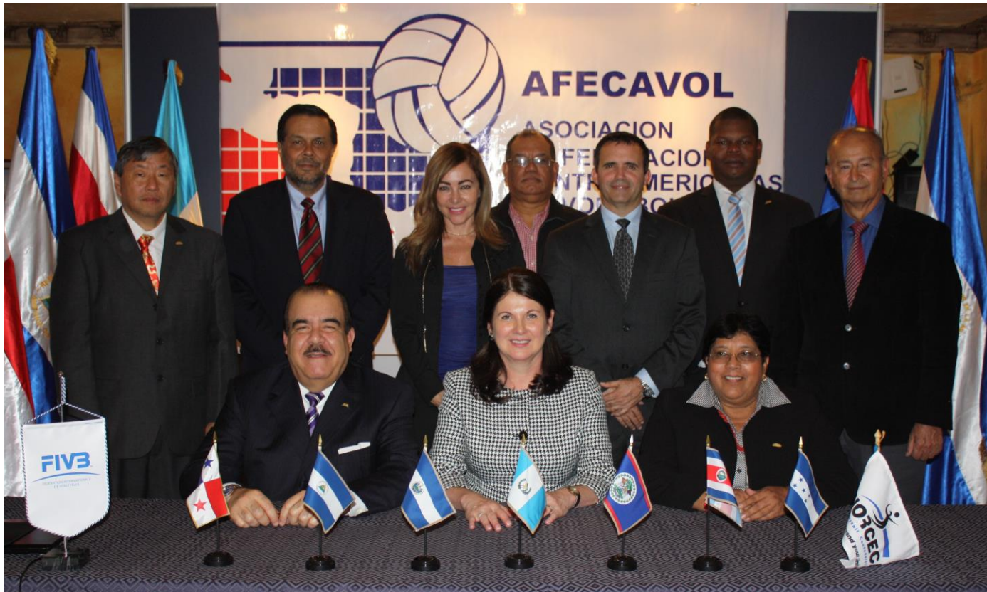
ASAMBLEA GENERAL 2015 GUATEMALA