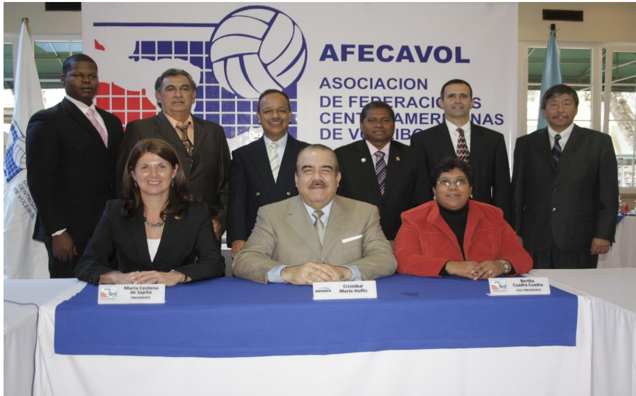
ASAMBLEA GENERAL 2011 GUATEMALA