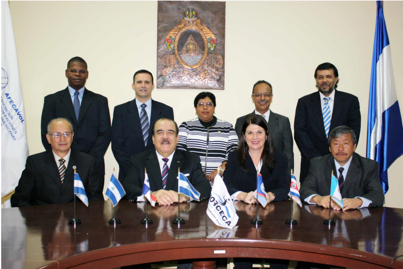
ASAMBLEA GENERAL ELECCIONARIA 2014 HONDURAS