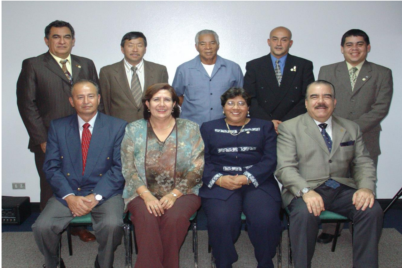
ASAMBLEA GENERAL 2006 Hotel Centro Colón