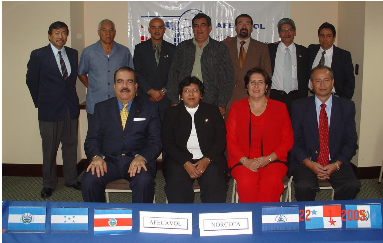
ASAMBLEA GENERAL 2004 Hotel Parque del Lago