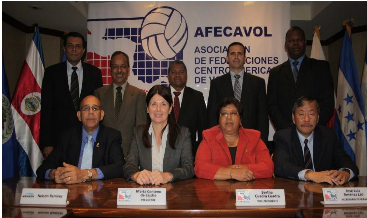
ASAMBLEA GENERAL 2012 GUATEMALA