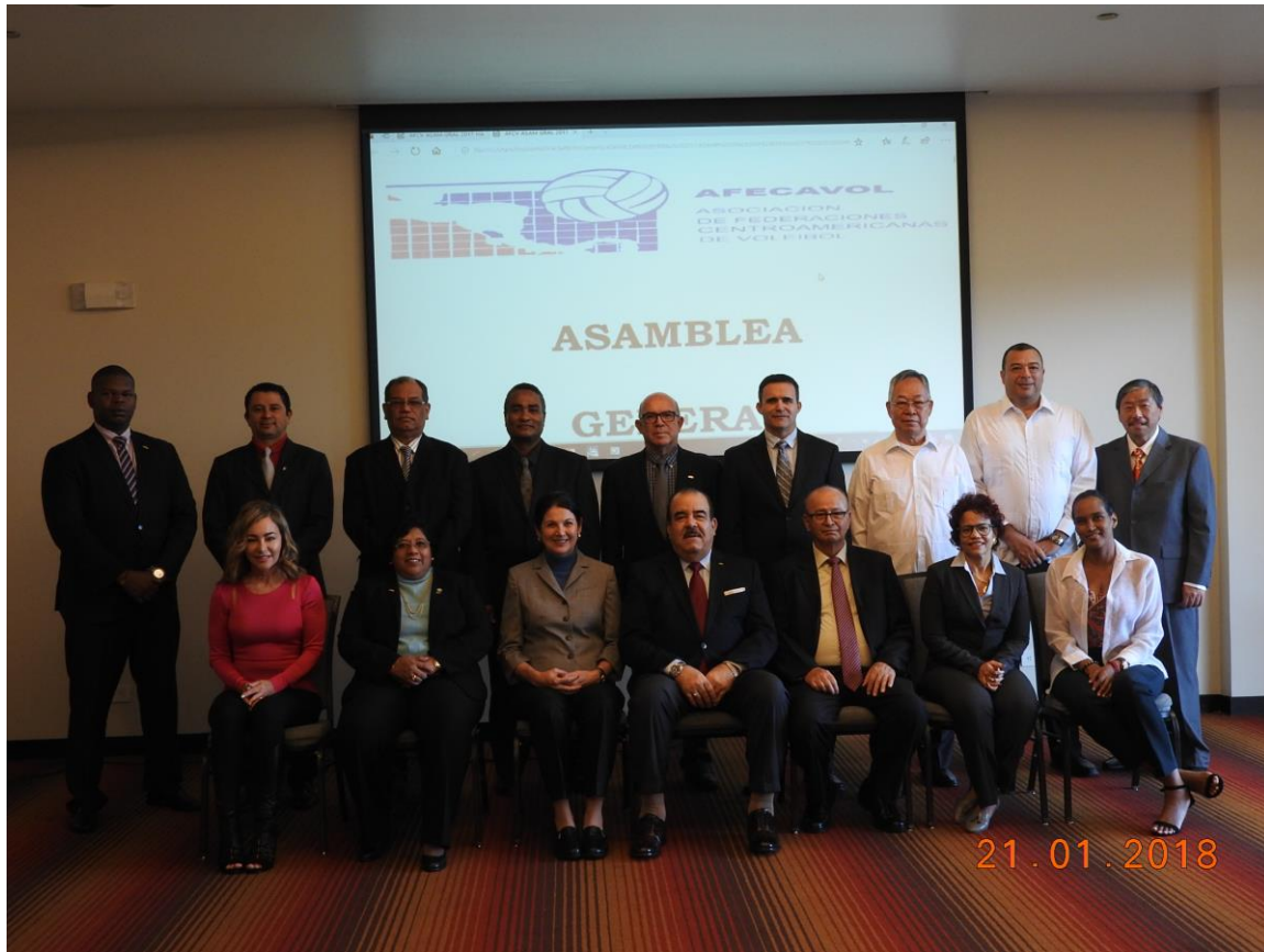
ASAMBLEA GENERAL 2017 COSTA RICA