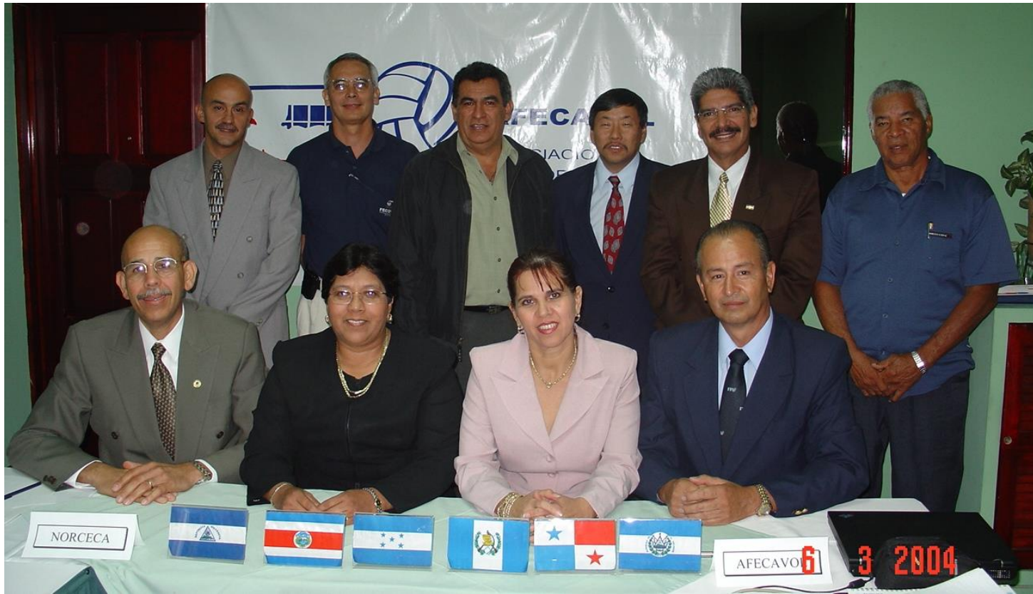
ASAMBLEA GENERAL 2003 Hotel Centro Colón